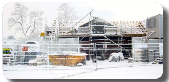
Diamond Jubilee Lodge Winter 2012 THE GRAPEVINE