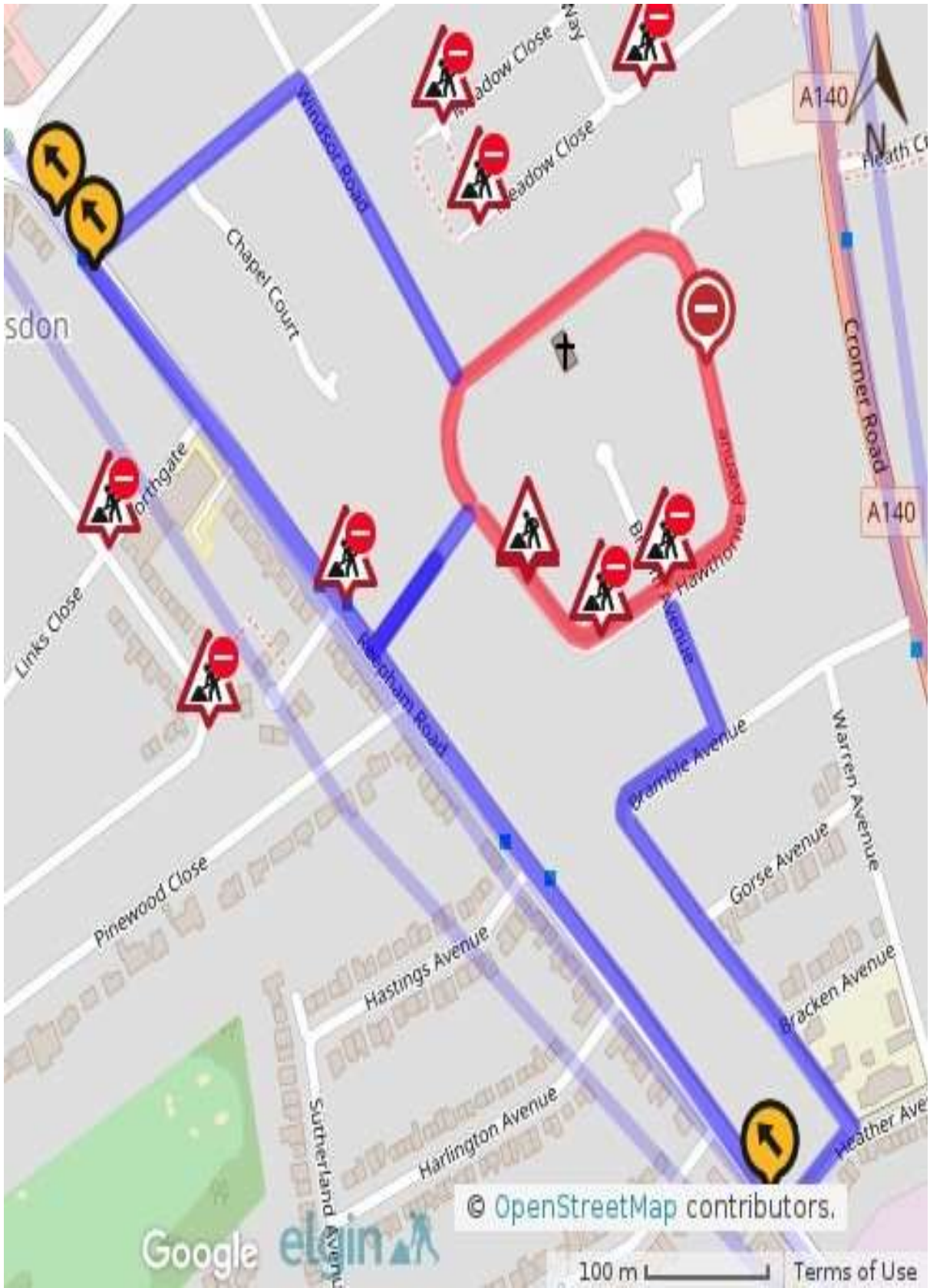
Hellesdon NTRO845 PT